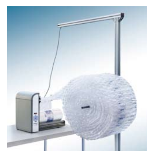
AIRplus® GTI shown with optional AIRplus® Coiler

Weight: 33 lbs Power: 120 v Speed: 75 fpm