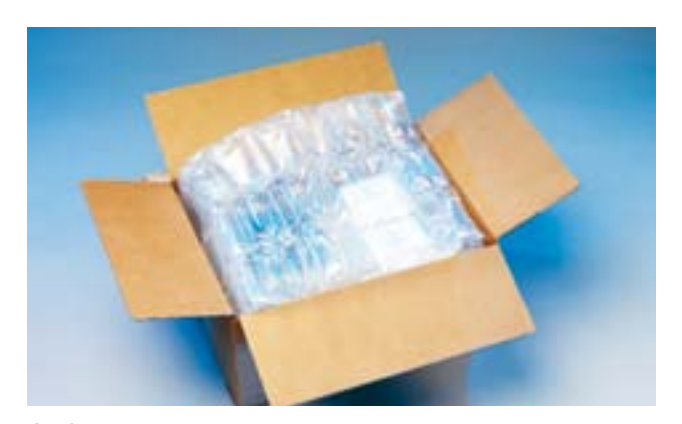
AIRplus® Cushion Film acts as void fill to protect expensive consumer packaging.