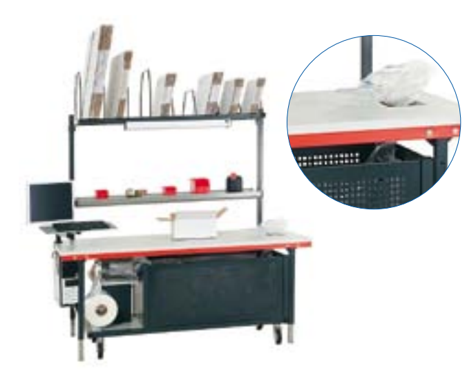
Standard single packing table with AIRplus® Mini feeding inflated Void Film into a convenient dispenser.