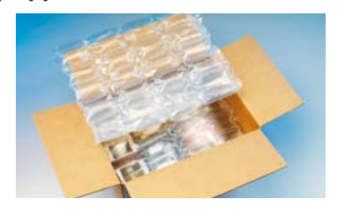
AIRplus® Cushion Film easily wraps around and protects individual unpackaged items such as the candles in this box.