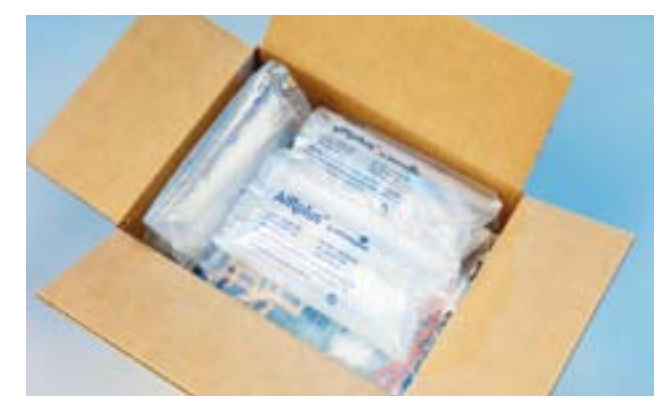
AIRplus® CX Film square bags easily block and brace stacked items such as books.