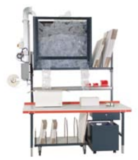
Packaging table with an integrated AIRplus® Mini.