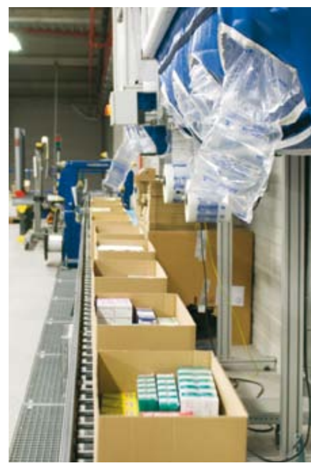
AIRplus® machines keep packing materials readily available by continually filling multiple access storage bins over packaging stations.