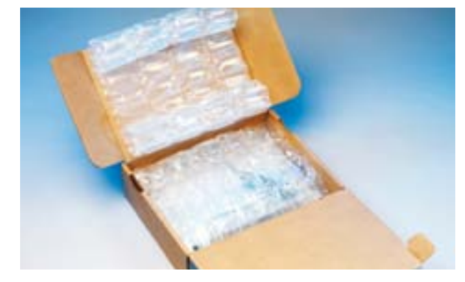
AIRplus® Cushion Film is rolled and positioned around this DVD player giving block and brace protection.