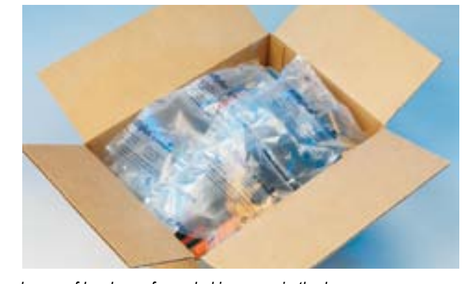
A fast and easy void-fill material, AIRplus® prevents items like small packages of hardware from shaking open in the box.