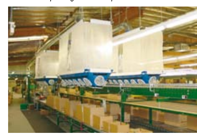
Example of a AIRplus® silo integration.