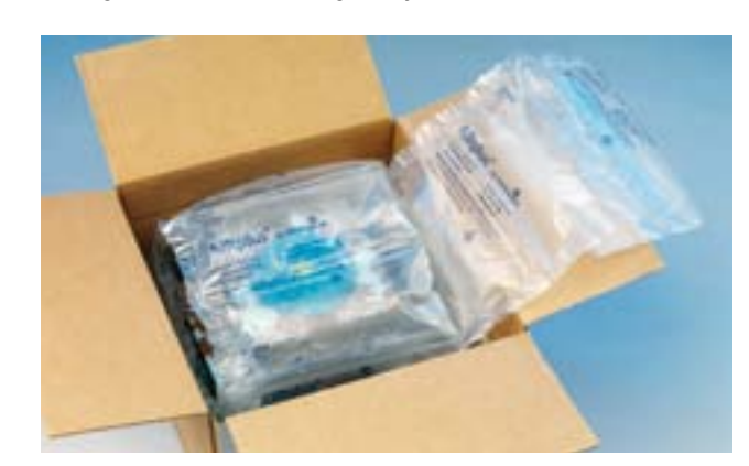
Using AIRplus® CX Film square bags for cushioning protect this gift tower of decorative boxes.