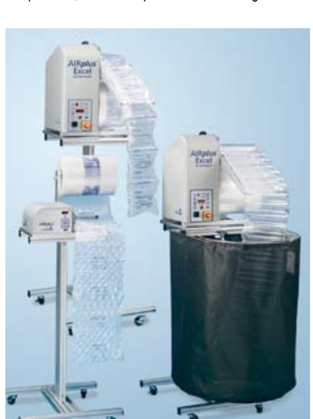
Stands and accessories are available for both AlRplus® models. The AlRplus® Accelerator is a bin with a built-in photoeye that continually checks bag accumulation and automatically initates production when inventory drops below a certain level.

Storopack AIRplus® machines are fast, compact, portable and extremely easy to operate. All AIRplus® models are completely programmable, offer quick and easy loading, and are among the most reliably built in the industry. With their small footprints and large production capacities they fit easily into any packaging environment — regardless of volumes. In addition, AIRplus® offers optimum flexibility with multiple packaging options including our comprehensive line of AIRplus® film products, convenient production enhancing accessories and Intelligent Delivery System and integration options.